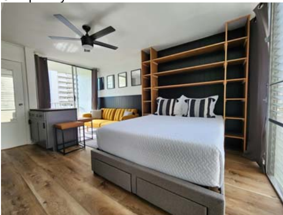
Queen size bed