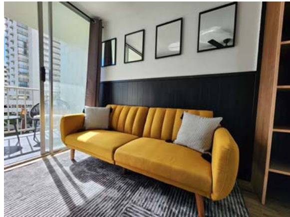
Sofa folds down into an additional bed