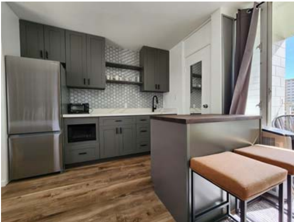
Completely remodeled studio

Pacific Islander, 5th floor, studio unit (456 sq. ft.) remodeled unit, lanai and mountain views. Vacation ready! LOCATION, LOCATION in this fully remodeled studio unit. Just blocks from world famous Waikiki Beach and International Marketplace. Walk to beach, shops and restaurants in minutes. Includes Kitchen, bath and beach accessories. Queen size bed, fold down couch, kitchen island with bar seating, quartz counters, walk-in glass enclosure shower with rain shower head, A/C in unit, private lanai, laundry in building. Free Wi Fi, TV with basic cable channels. No parking space. Security gate building entry. Minimum 90 day rental term. Rates start at $2,000 per 30 days, plus cleaning & Hawaii state taxes.