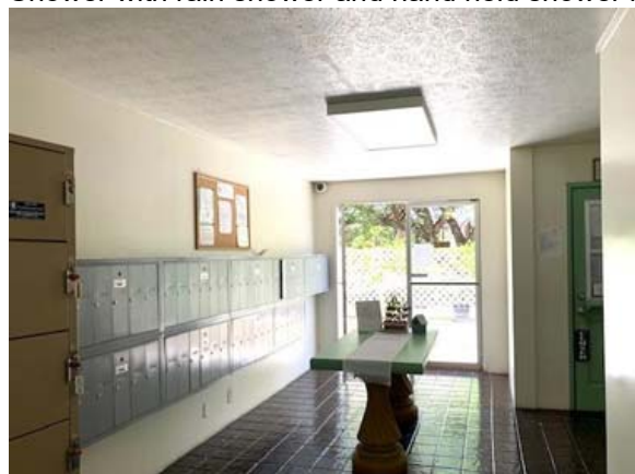
Secure entry into the building